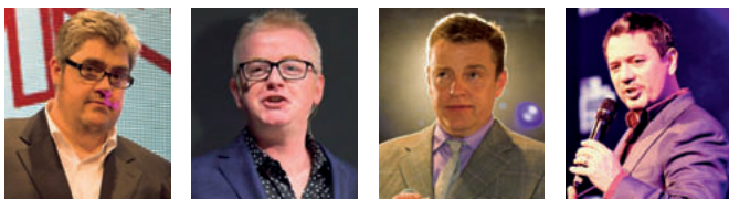
Just a few past hosts of the TPI Awards.